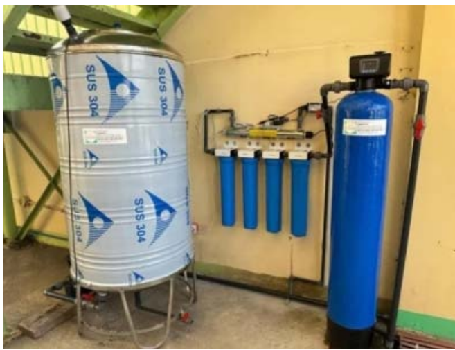
Pictured: Reverse Osmosis System

In March 2025, the Rotary Club of Silverdale, Washington, and the Rotary Club of Orion, Philippines, brought clean, safe drinking water to three schools in the municipality of Orion, Bataan, through a District 5020 Matching Grant project.